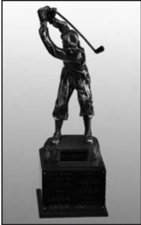
Beta Shoot Out Traveling Trophy