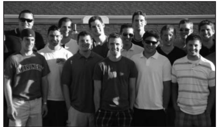
Seniors pose for a group picture on the beach after dinner