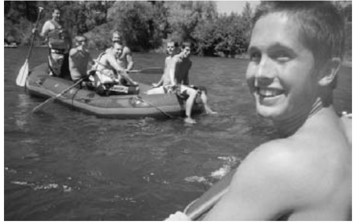
Betas enjoying the sun while rafting along the Yakima River.