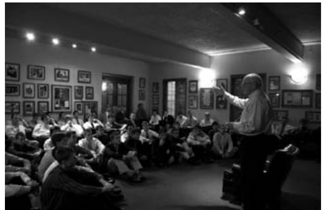
Bruce Nordstrom speaks at chapter and gives some words of wisdom.

On Monday October 19th, Alumni Bruce Nordstrom came to chapter and gave a life talk to the actives as well as the pledges. Mr. Nordstrom spoke of his past and how he went from mopping the floors of a shoe store when he was nine to being one of the most prominent figures in a company that employs 70,000 people. He gave the advice that having exceptional service is essential to running a business. He also spoke of some of his favorite memories while living in the Beta house and other various encounters which he felt have shaped his life. Then he opened up to any questions we had for him. Topics ranged from running a family business to picking which shoes to sell to customers to what his vision for Nordstrom's was 50 years ago. Overall, the talk gave much insight to how Mr. Nordstrom became such a success and tips on how we, as young businessmen, should act in order to be successful. We would like to thank Mr. Nordstrom once again for coming in and giving this wonderful speech.